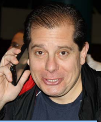
Will "The Thrill" - 2nd!