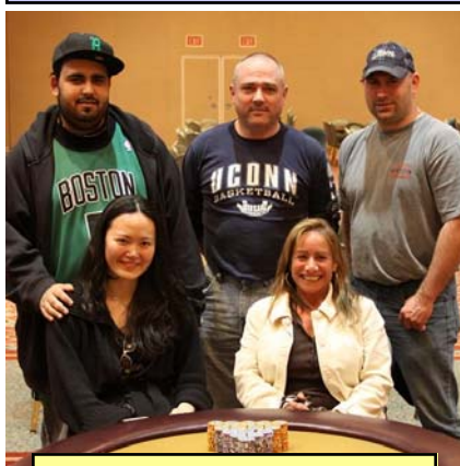
The Final Five!