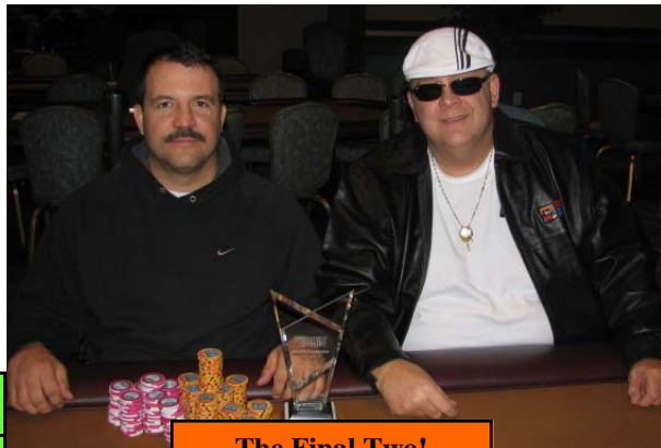
The Final Two!