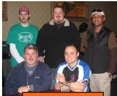
The Final Five!